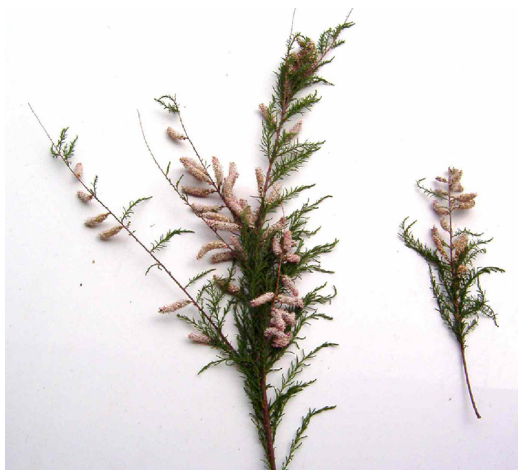
Figure 2 Young stems of Tamarix gallica L. used to heal warts.

" Tamarici, tamarici, tamarici / di NN anni avete / di lunedì siete nato / tamarici AB ha il porro e non me lo dici. . . " (In English: " Tamarisk, tamarisk, tamarisk / NN